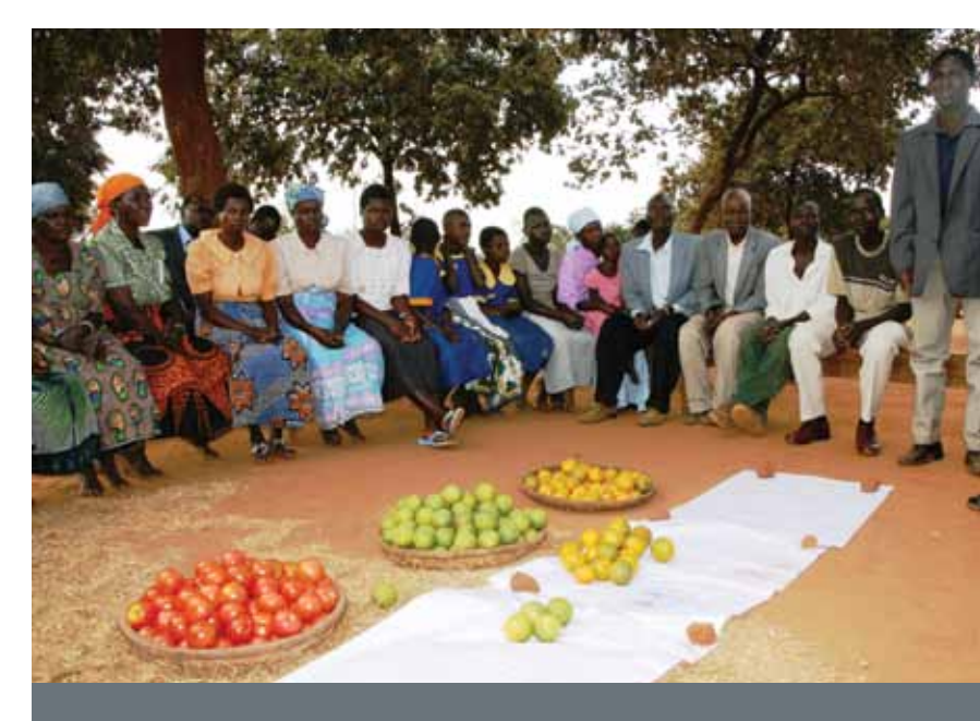
Photo: Community discussions on the MDGs, Uganda.

policy. Chief among these collaborations is reproductive health policy, in which NGOs and the government would work together to improve services and breadth of coverage. The Inter-Institutional Group on Reproductive Health gave the women's movement in Mexico privileged access to forums for policy design and monitoring. As a result of the strong relationships between public institutions and NGOs, many of the services provided and advocated by the NGOs have since come under government remit, representing a successful use of social accountability for positive policy change.185