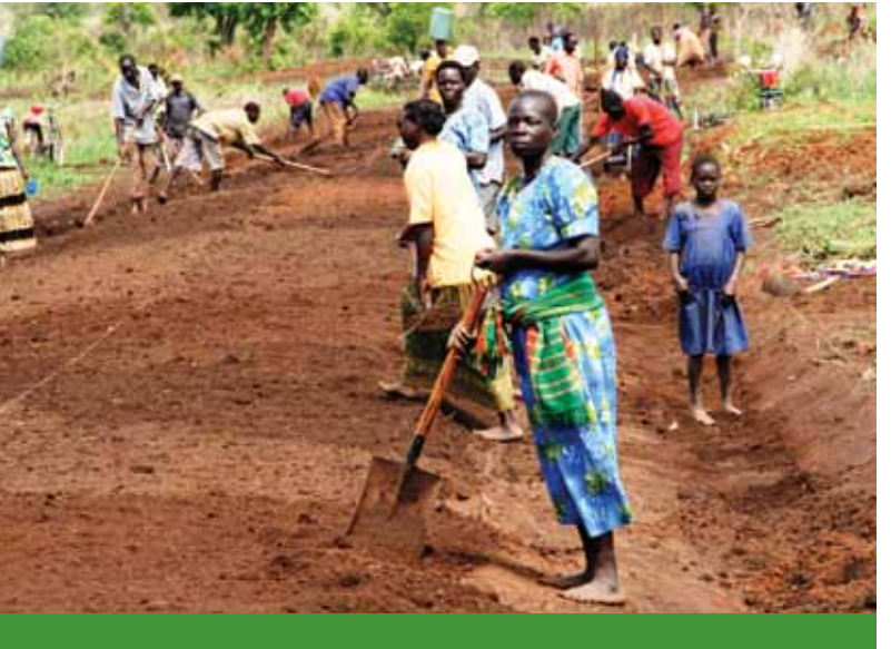
Photo: Community road-building in northern Uganda.

While there are many examples of the contributions of citizen engagement to building responsive states, these do not always occur. In other examples, engagement can lead to elite capture, clientelism and patronage, or increased frustration of those involved. Moreover, the types of strategies and outcomes that can be expected vary a great deal according to context.<sup>158</sup> Yet these are dependent in turn, on a combination of the forms of mobilisation used and the political contexts in which they occur. In fragile states or emerging democracies, associational forms of citizen mobilisation may contribute most importantly to the constructing of