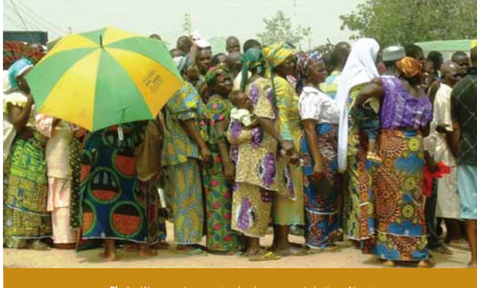
Photo: Women voters queuing, local government elections, Nigeria. © Emma Donnelly / DFID

of political settlements plays a central role in the durability of such settlements. Tanzania is a case in point, where the enduring legacy of postcolonial nation-building continues to influence contemporary political processes.<sup>43</sup>