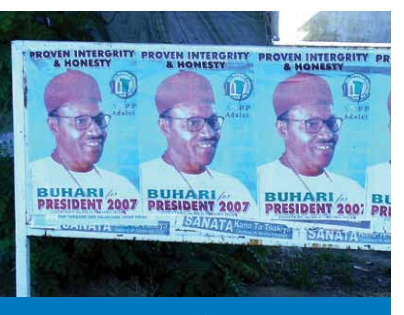
Photo: Campaign posters for the 2007 Nigerian presidential elections. © DFID Emma Donnelly / DFID

Federalism and decentralisation can each contribute to power-sharing and sustaining political stability. Federalism distributes power across society, and in large, diverse countries can make a major contribution to power-sharing and sustaining peace. But the design of the constitution is critical, because ethno-federalism (where each region includes just one group) can lead to separatism. This was the case of Biafra in Nigeria – Nigeria's redesigned federal system, with a much larger number of small and multiethnic states has been vital for the political stability of the country.<sup>130</sup> Decentralisation can also help diffuse power. For example, it has made an important contribution to reducing national level conflict in Indonesia.<sup>131</sup>