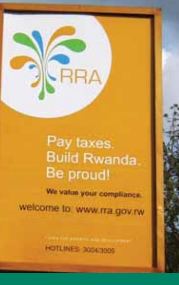
Photo: Rwanda Revenue Authority poster, Kigali 2008.