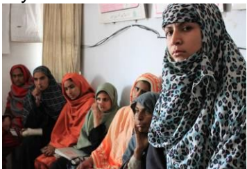
Mandra's Lady Health Workers

Further support from UK aid will prevent another 3,600 mothers' deaths by 2015 and allow 400,000 more families to choose the number of children they have.